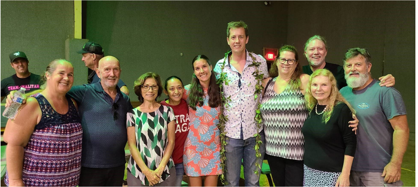
Seth Keshel Election Integrity Lecture Kauai Attendees June 3, 2022