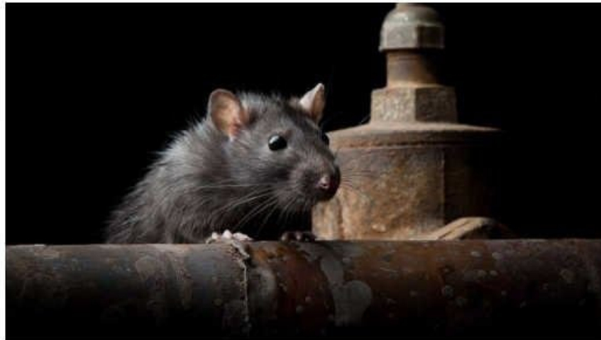
With apologies to the Rat Community!